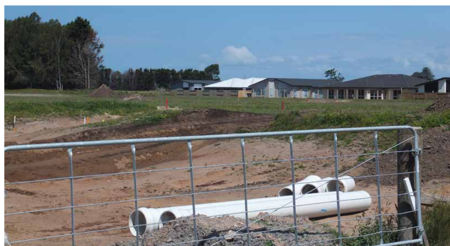
A greenfields SHA, showing earthworks and new homes.