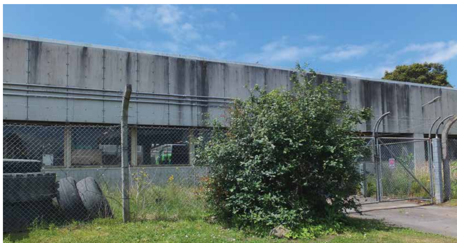
A brownfields SHA on which 130 apartment and townhouses are proposed.

B. James, 2017, Getting the housing we say we want: Learning from the special housing area experience in Tauranga and the Western Bay of Plenty. Paper 1 - National Policy and Initial Local Implementation. Report for Building Better Homes, Towns and Cities SRA: The Architecture of Decision-Making, Life as Lived Component. December 2017. Wellington: BBHTC. http://www.buildingbetter.nz/research/decision/publications.html