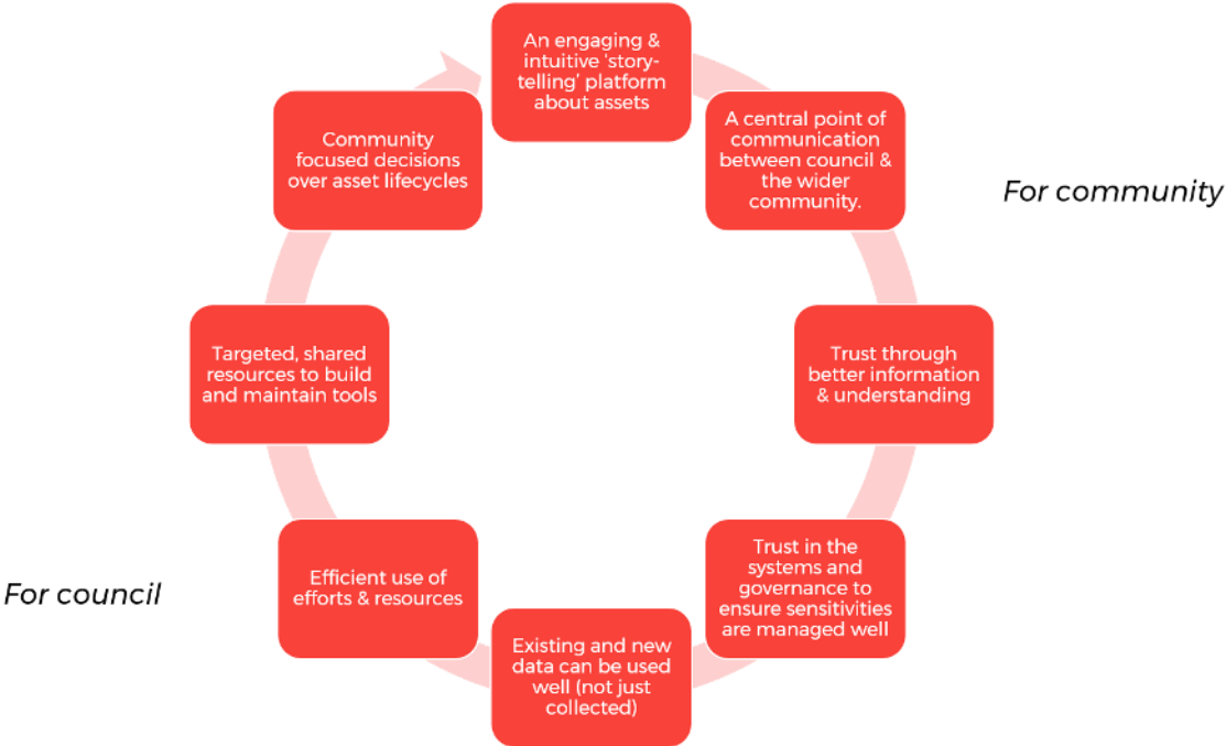
Figure 3: The Value cycle for digital tools to aid asset level of service

As discussed above, a key challenge faced by asset managers to setting levels of service is balancing limited resources with ever expanding demand and changing technological and environmental contexts. For example, the pilot identified that accounting for anticipated future climate change through planning for enhanced use of green space in a suburban water catchment needs to account for limited resources to build and operate pipes with changing expectations for recreational space,